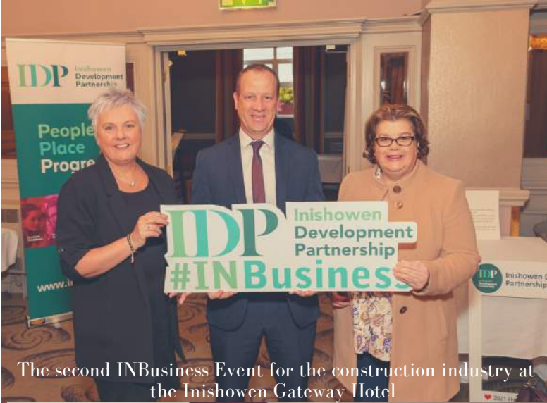
The second INBusiness Event for the construction industry at the Inishowen Gateway Hotel