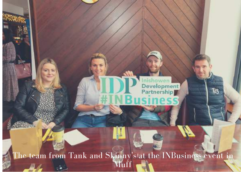
The team from Tank and Skinny's at the INBusiness event in Muff