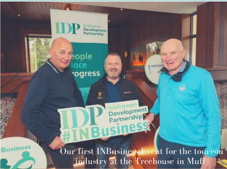
Our first INBusiness Event for the tourism industry at the Trechouse in Muff