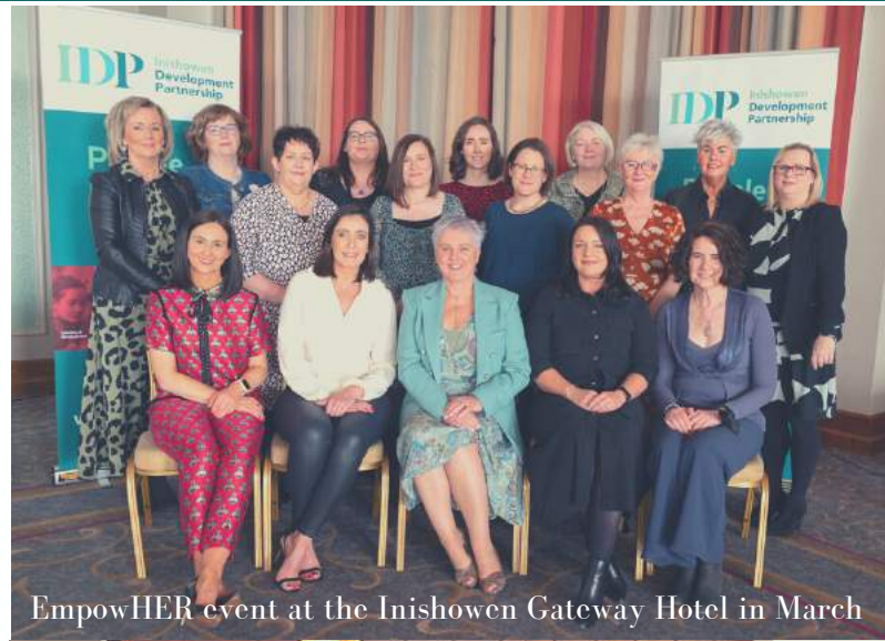
EmpowHER event at the Inishowen Gateway Hotel in March